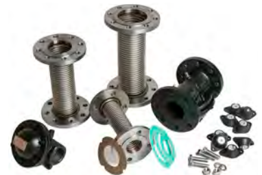
Installation Kit Included with all Package Gas Boosters.

Dimensional Data diagrams available upon request.