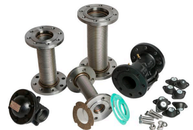
Installation Kit Included with all Package Gas Boosters.