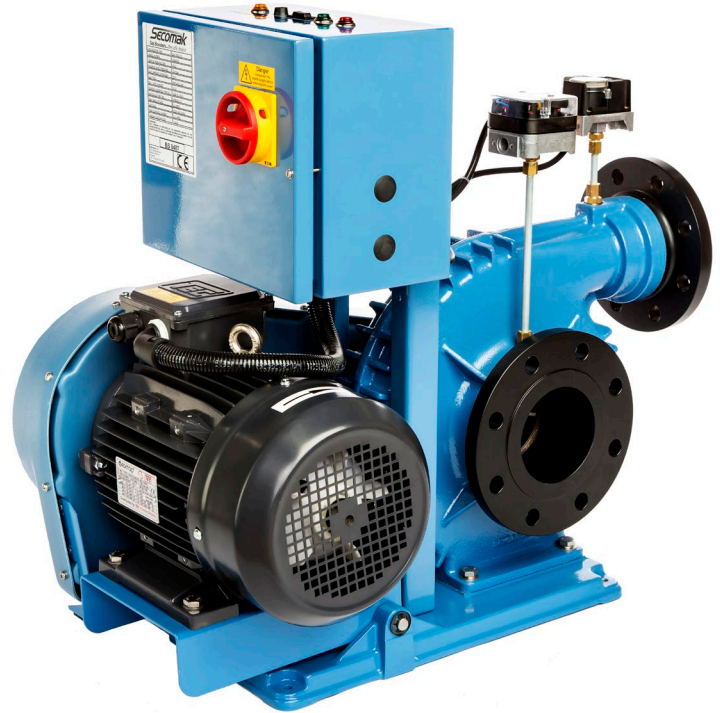
Product supplied may differ from image based on pressure requirements. Image represents Package Gas Booster including controls.